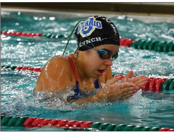
SEVEN ONTARIO HIGH SCHOOL boys qualified for the district swim meet. All the girls placed in sectionals to advance to districts.