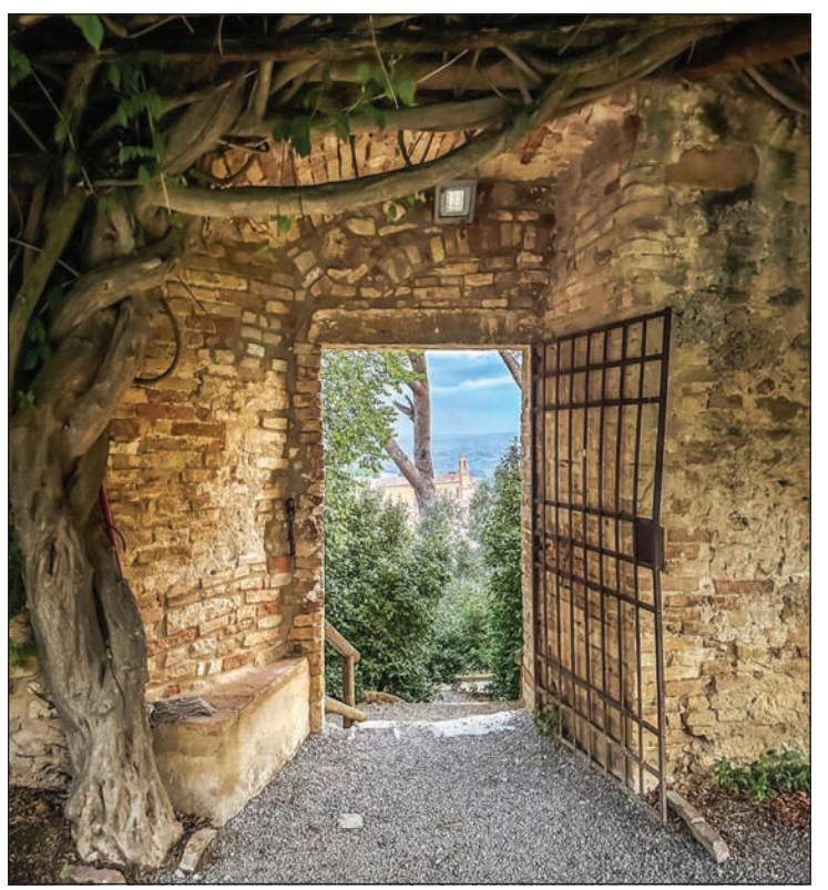
San Gimignano, Italy