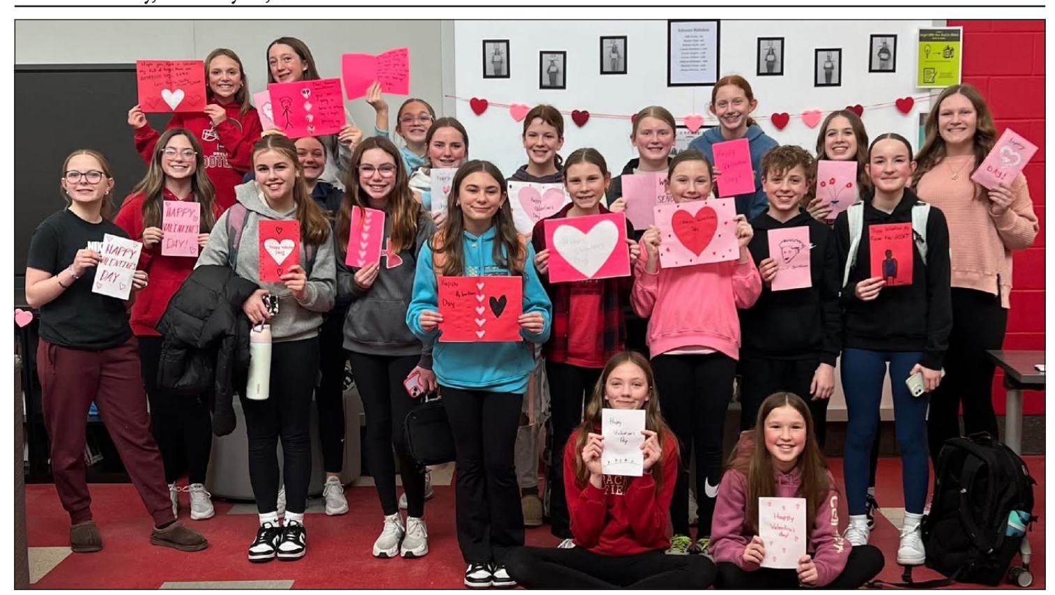
SHELBY MIDDLE SCHOOL'S Student Leadership Team put their hearts into making over 90 Valentine's Day cards for the residents of Crestwood Care Center.