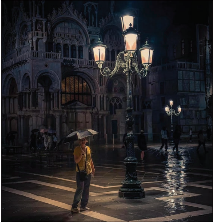
Piazza San Marco in Venice, Italy