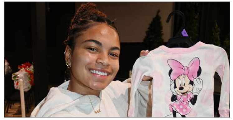
ONTARIO'S WARRIOR LEADERSHIP COUNCIL helped with Crossroad's Adopt-A-Child program, which serves over 1,000 local children.