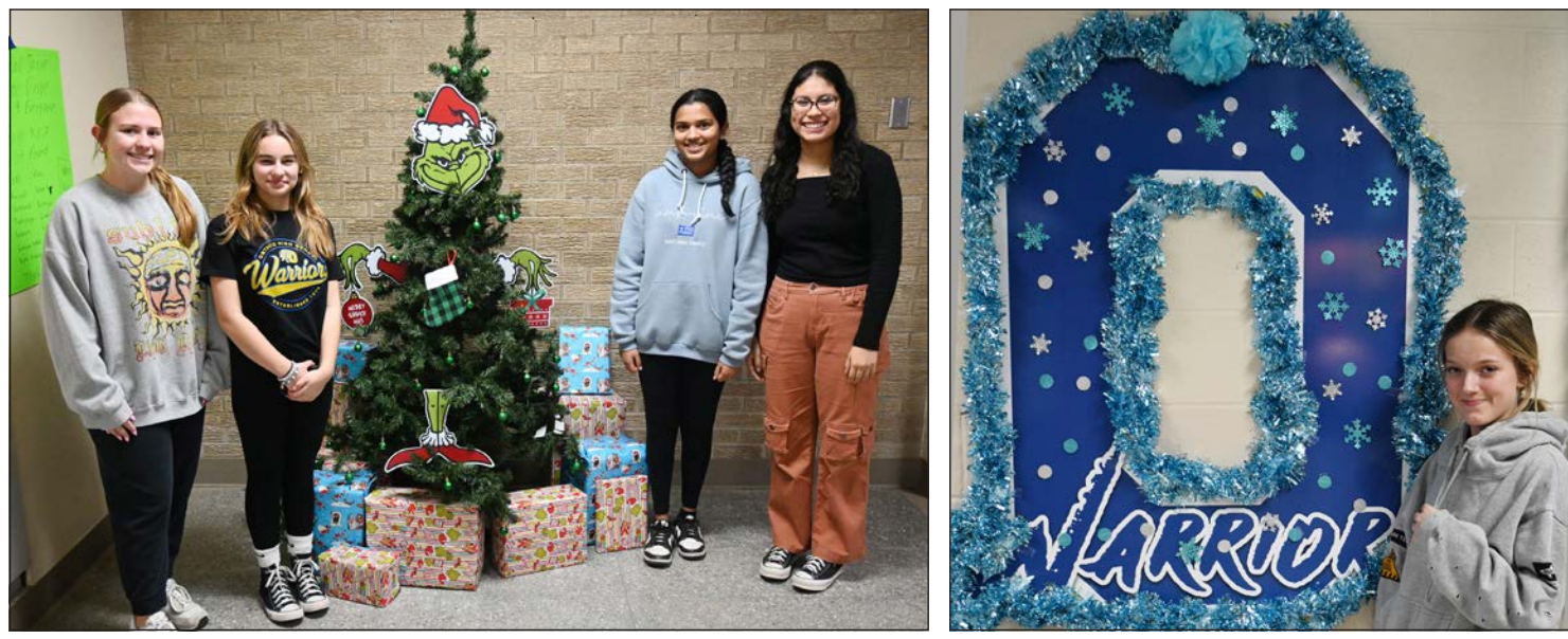
ONTARIO HIGH SCHOOL students worked together to decorate the hallways for Christmas. Each class had a theme: freshmen, Grinch; sophomores, Santa's Workshop; juniors, Blue Christmas; and seniors, Nightmare Before Christmas.