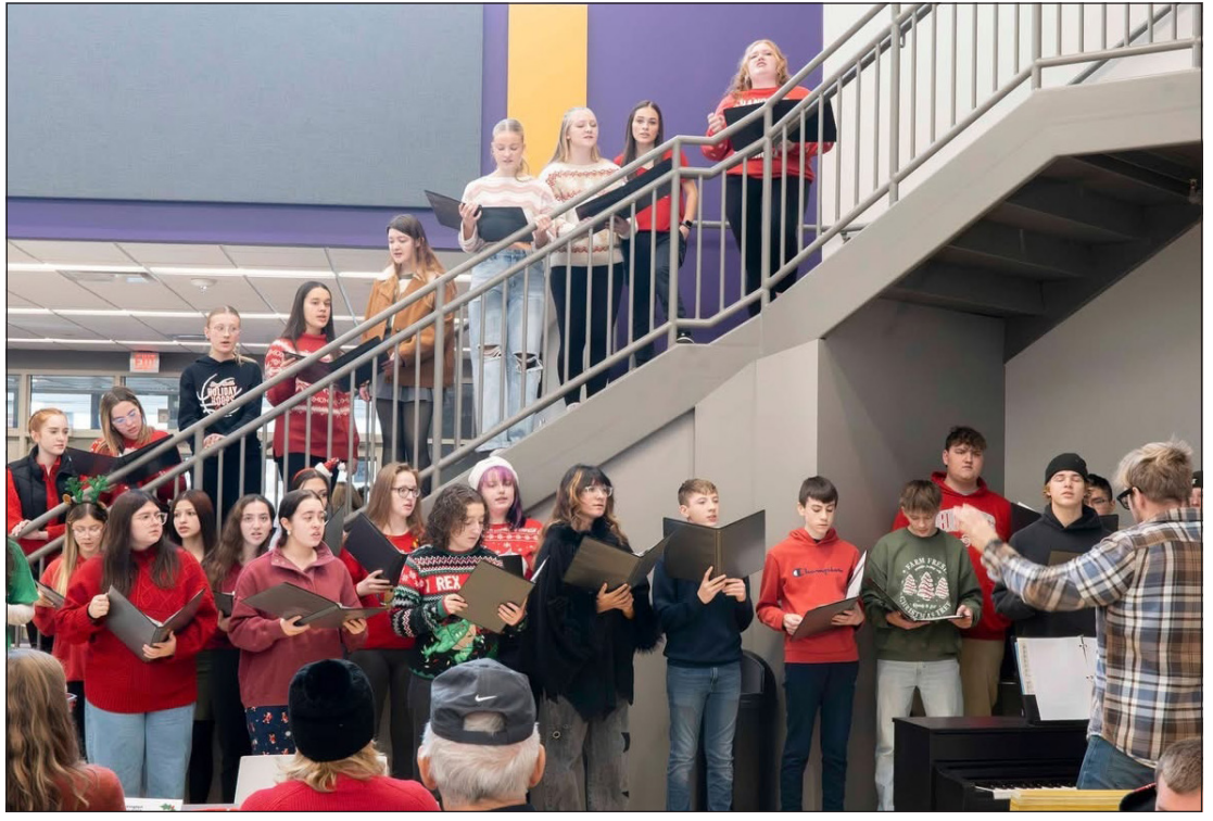
STUDENTS FROM LEXINGTON'S KEY CLUB pitched in at the annual Breakfast with Santa on Saturday, Dec. 7. The Lexington Kiwanis Club served sausage and pancakes to over 900 community members while Santa posed for photos, the PAC screened holiday classics, Una Voce sang carols and orchestra members performed in a festive strings ensemble.