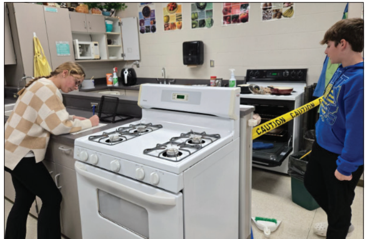
IN RECENT WEEKS , students in Ms. Owen's Family and Consumer Science classes at Ontario have been engaged in hands-on learning about kitchen safety. They explored essential topics like preventing cross-contamination, practiced accurate measurement techniques, took part in a measurement challenge and enjoyed a kitchen scavenger hunt. Students tackled "The Kitchen Mishap" case — an interactive mystery set up with caution tape, crime scene markers, a strawberry sauce-covered knife, a chalk outline and various kitchen hazards. Students worked to piece together what happened to the "injured" party while identifying potential safety risks. The last week culminated in a baking project where students across all six periods made cookies for the school dance, enjoying the treats they created. These activities not only teach valuable life skills but also make learning fun and interactive.