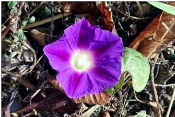
A Morning Glory in November

To submit a news brief item send an email with information to news@tribune-courier.com . To advertise email tribune.courier.traci@gmail.com