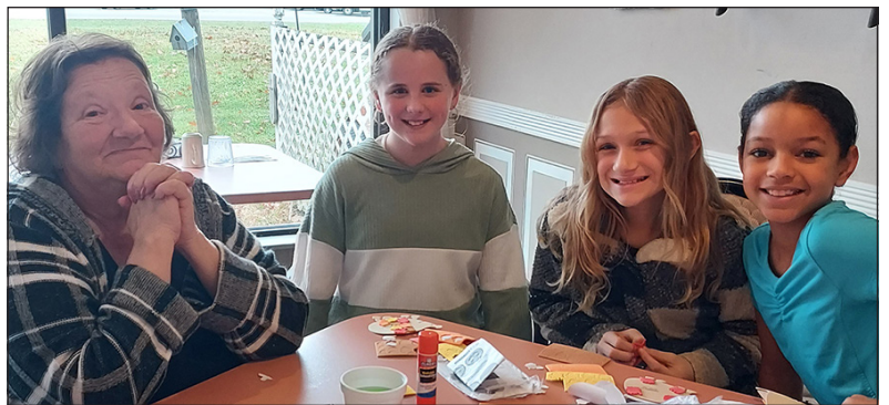
ONTARIO'S KINDNESS CLUB students visited the nursing home. They will be going at least once a month for the rest of the year.