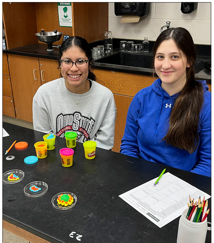
BIOLOGY STUDENTS at Ontario High School are learning about mitosis and stem cells. After the lesson, students completed a lab in which they modeled stem cells and embryo formation using clay. Students enjoyed building and said it helped them to remember the stages of formation and stem cell biology much better than on paper.

Learn more about H2Ohio at https://h2.ohio.gov .