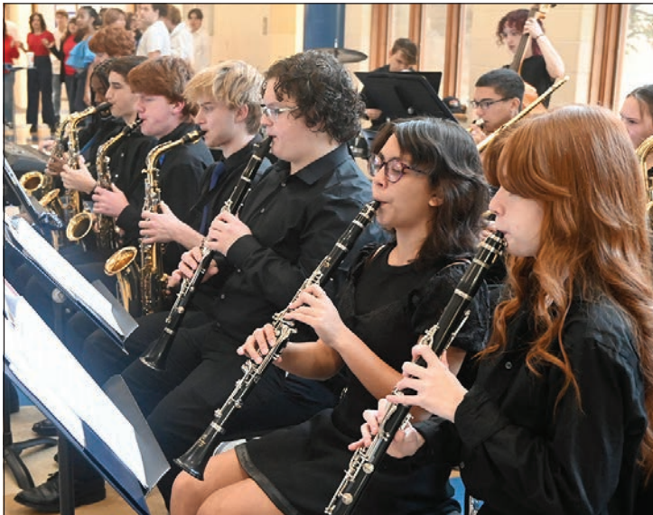
ONTARIO HIGH SCHOOL celebrated Veterans Day with a breakfast to honor local veterans. Both the show choir and jazz band performed. (See More Photos on Page 10)