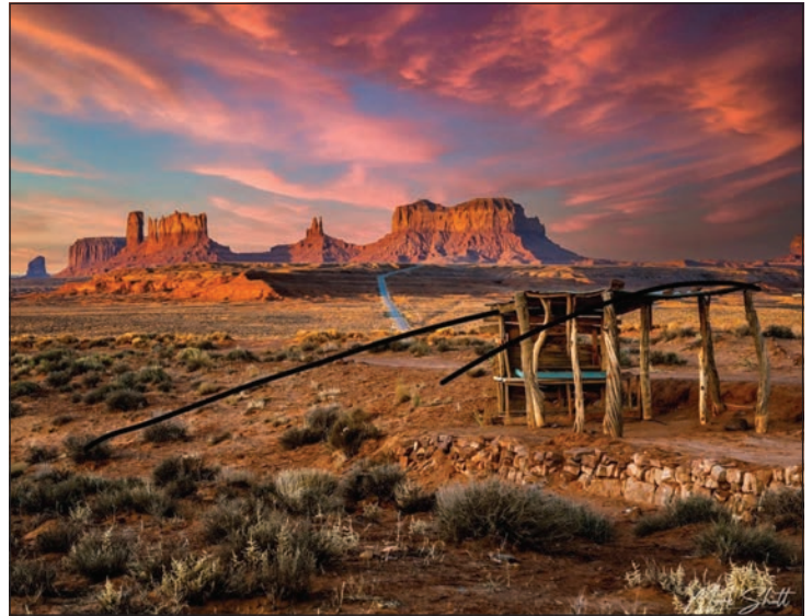
Monument Valley, Arizona

The next Ontario Board of Education meeting will be held on Tuesday, Oct. 8.