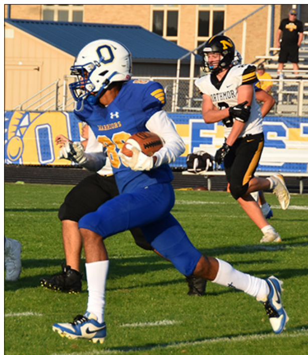
Ontario High School Freshman Football vs Northmor on Sept. 16