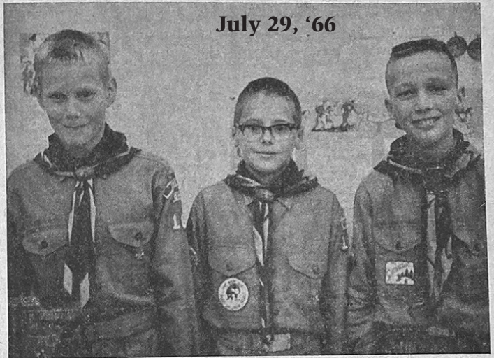
July 29, '66