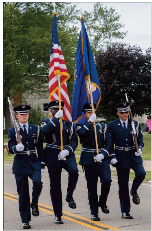
The 179th Airlift Honor Guard led the Ontario 4th of July Parade on Saturday, July 3.