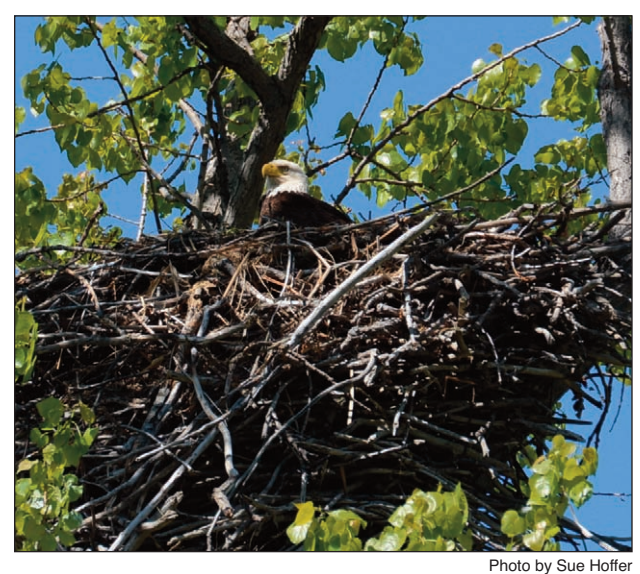
A SYMBOL OF FREEDOM , a Bald Eagle sits in its nest at Magee Marsh near Oak Harbor, OH.