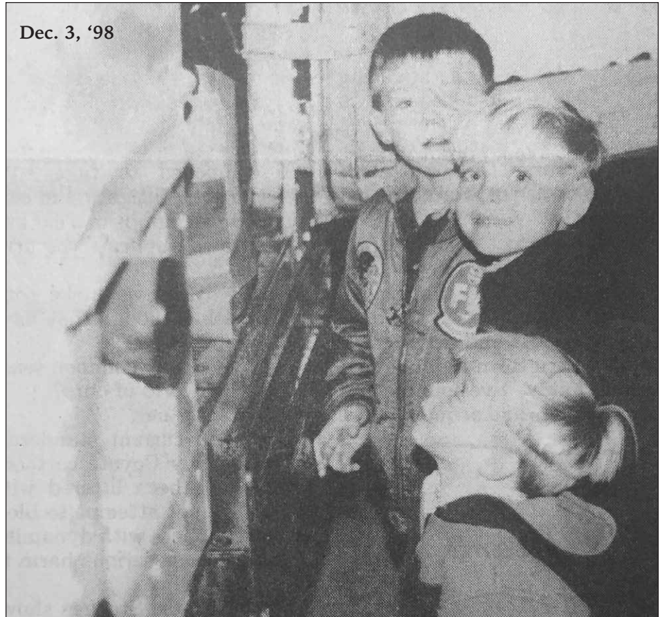
Dec. 3, '98