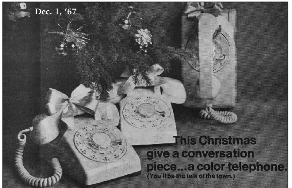
Dec. 1, '67

A tape recorder, for example, requires 4,900 labels. The collection of labels will continue until Christmas vacation.