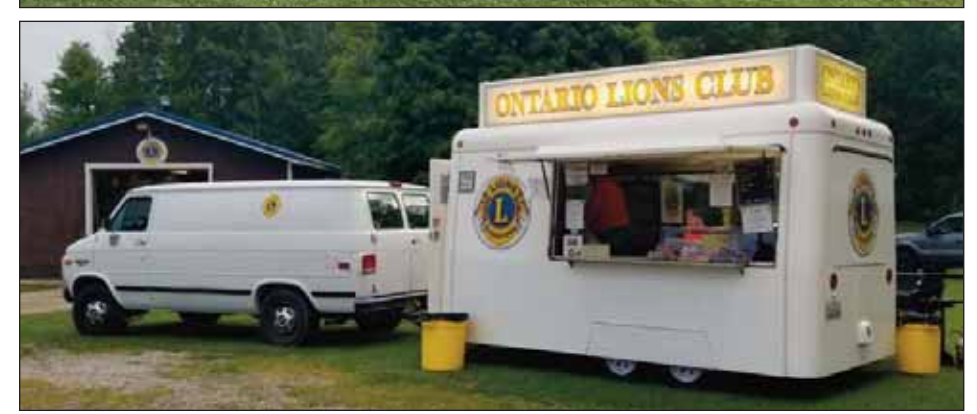
ONTARIO LIONS CLUB held its "BIG Yard & Craft Sale" Saturday, Aug. 15 at Ontario Lions Clever Park, Snodgrass Rd., Ontario. All money raised went to support Ontario Lions Club Community Projects.