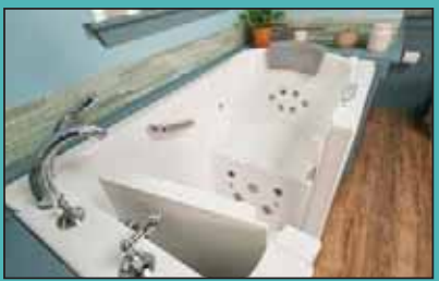
44 Hydrotherapy Jets