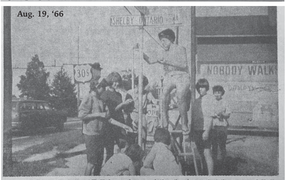
Members of the Rockettes 4-H Club are shown painting the sign post at the corner of Shelby-Ontario Road and Park Avenue West in downtown Ontario.