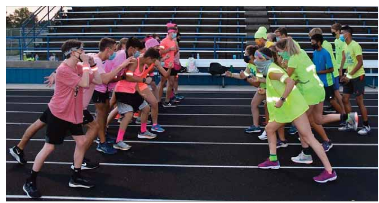
THE ONTARIO HIGH SCHOOL cross country team broke up into two teams to race one another in a 2-mile timed trial on Saturday, Aug. 15. The team had fun with some silly and competitive poses.