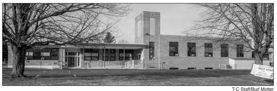
THE MADISON BOARD OF EDUCATION will plan to purchase the Lincoln Heights Building at 1035 Grace St., Madison area, to replace the current Jesse Beer building.

The next meeting will be held Wednesday, March 25, in the Madison Middle School Auditeria.