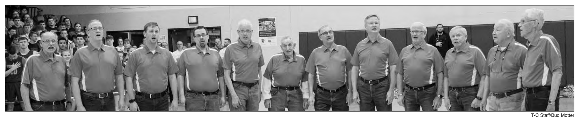
FUN CENTER CHORDSMEN members sing The National Anthem prior to the start of the Lexington Minutemen boys varsity contest against the Shelby Whippets in Lexington.