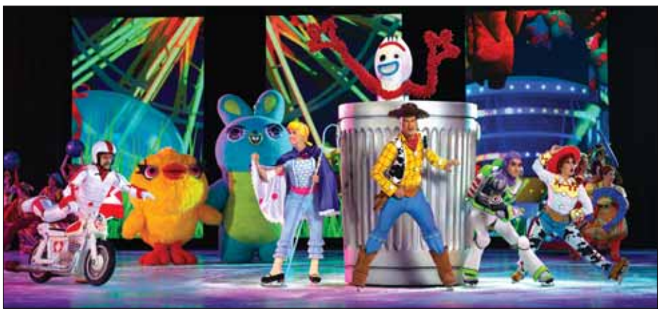
WOODY, BUZZ AND THEIR FRIENDS from Disney Pixar's Toy Story 4 are among the many beloved characters visiting Cleveland as Disney on Ice Presents Road Trip Adventures