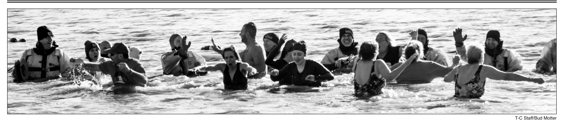
THE TRADITIONAL POLAR DIP event was held New Year's Day, Jan. 1, at Charles Mill Lake. With clear skies and temperatures in the low 30s, a crowd of kids and adults took to the waters. The event was held to raise money for cancer awareness.