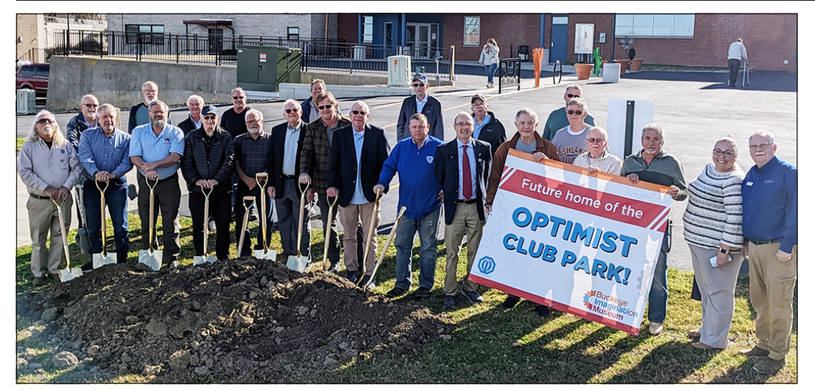
A GROUNDBREAKING CEREMONY for a new park was held on the property of the new Buckeye Imagination Museum on Nov. 9