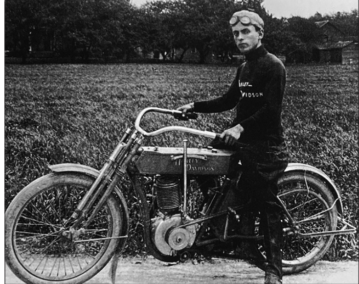
"PEG" on his 1913 single cylinder flat belt drive Harley Davidson. Note the HD shirt and goggles.

By-lined stories are opinions of the writers and do not necessarily reflect the position of this newspaper