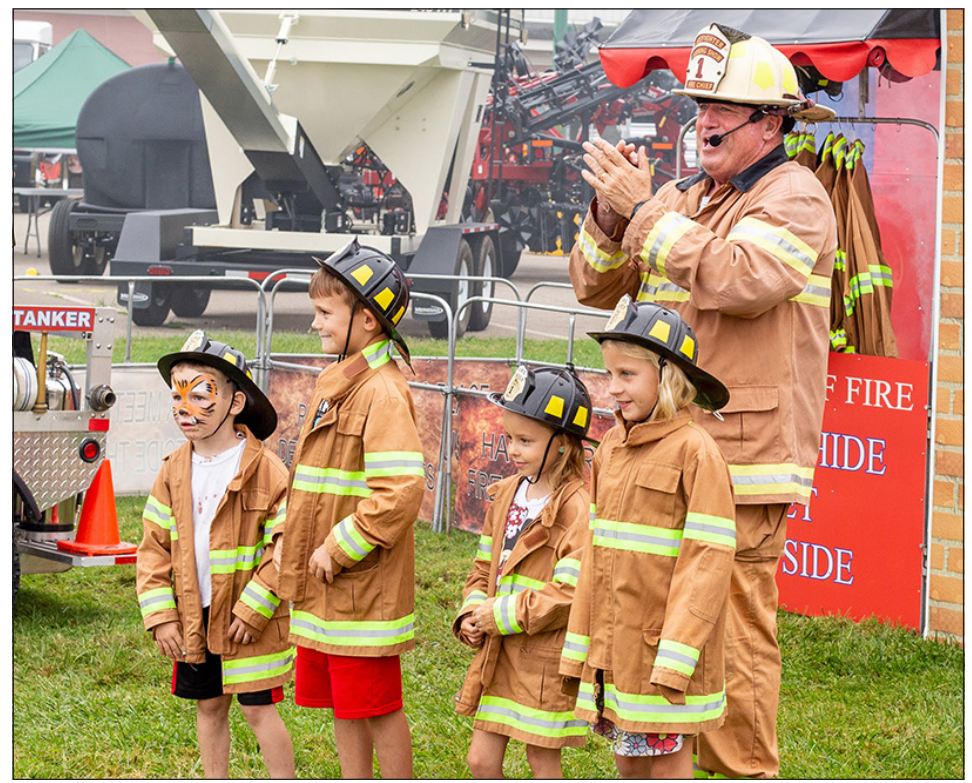
A FREE FIRE SAFETY SHOW, sponsored in part by Franklin Township Firefighter's Association and the Shiloh, Cass, Bloomingrove Firefighter's Association, pulled participants from the crowd to help.