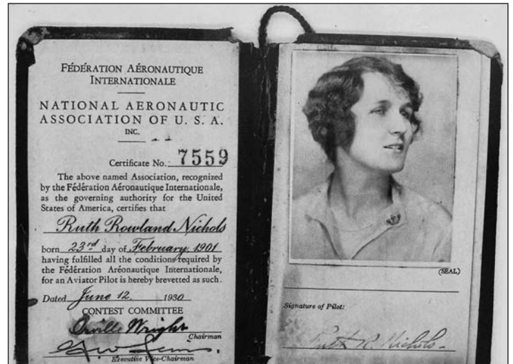
RUTH NICHOLS needed permission to fly the Atlantic after Charles Lindbergh's trip. Her permission license was signed by chairman Orville Wright.

The Gages Air Field was sold to General Motors in 1955.