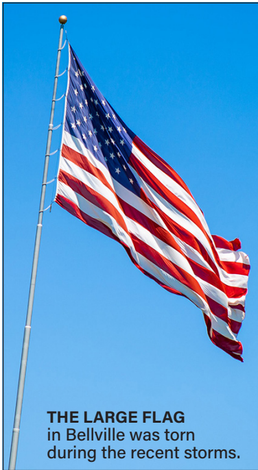
THE LARGE FLAG in Bellville was torn during the recent storms.