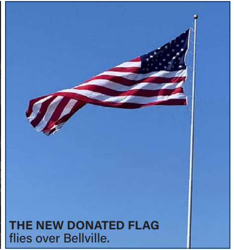
THE NEW DONATED FLAG flies over Bellville.