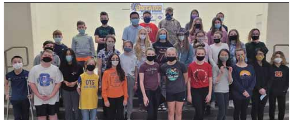
Ontario Middle School Sixth Grade All A's