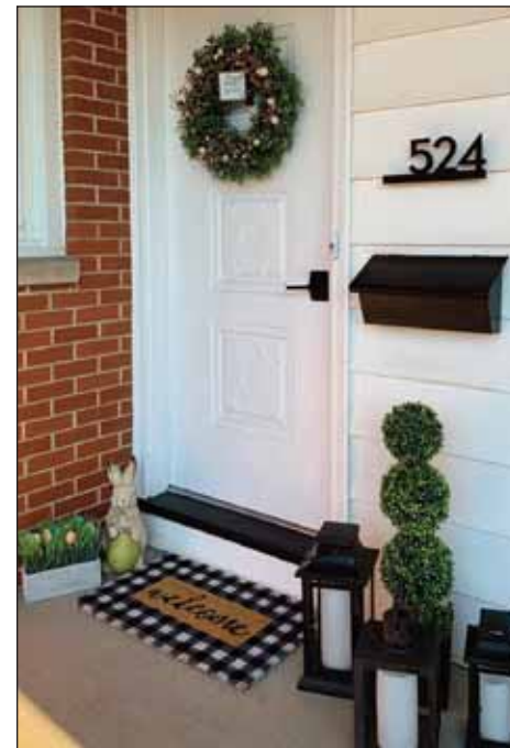
THIS LOCAL PORCH was spotted as a great Easter decorating design idea.

The Ohio District 5 Area Agency provides leadership, collaboration, coordination and services to older adults, people with disabilities, their caregivers and resource networks that support individual choice, independence and dignity.