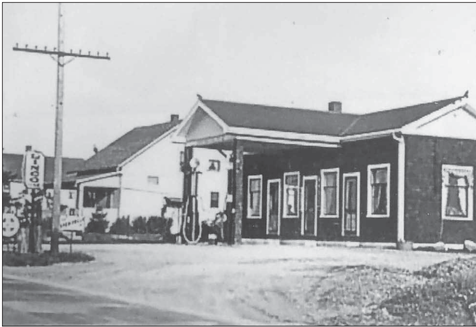
THE GAS STATION where the murder was committed was originally a Linco brand and later a Gulf station.