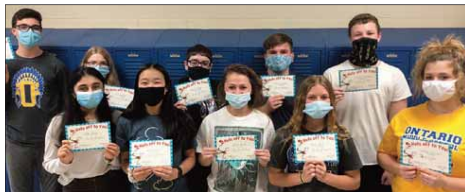
THE TOP TEN EIGHTH GRADE READERS for AR at Ontario Middle School for the first three nine weeks were congratulated for their accomplishments.