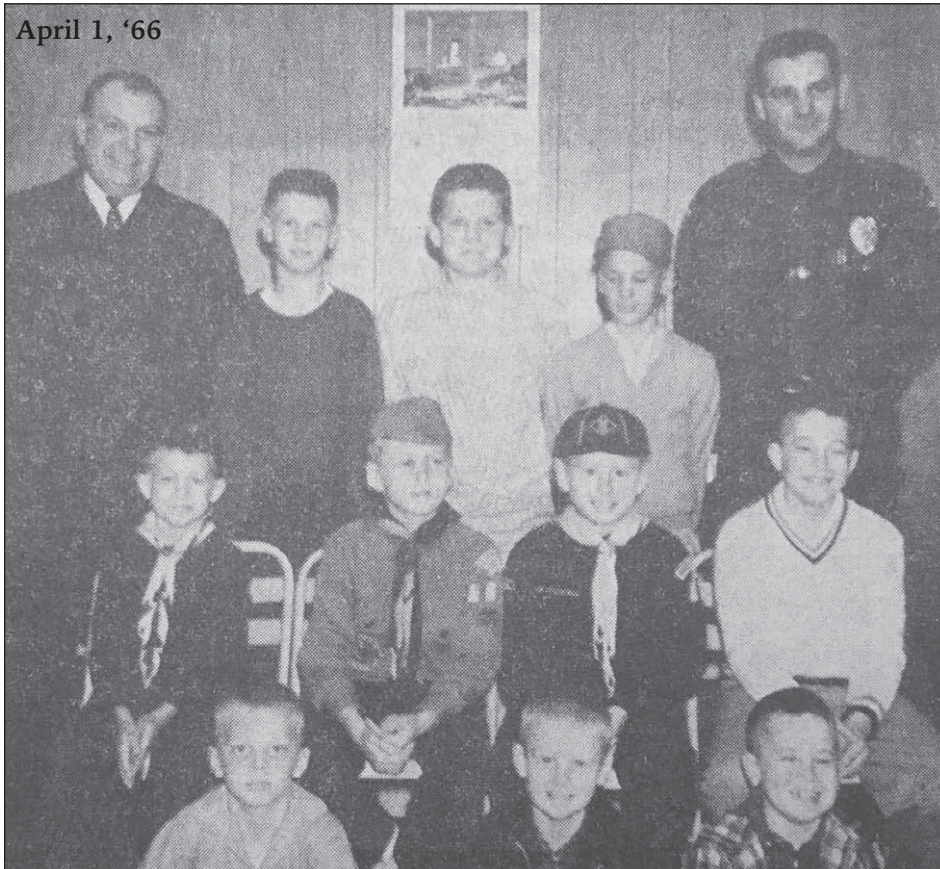
April 1, '66