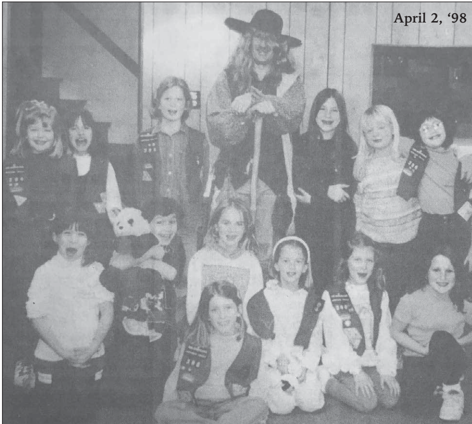
April 2, '98