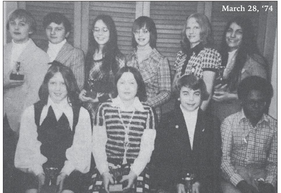
March 28, '74