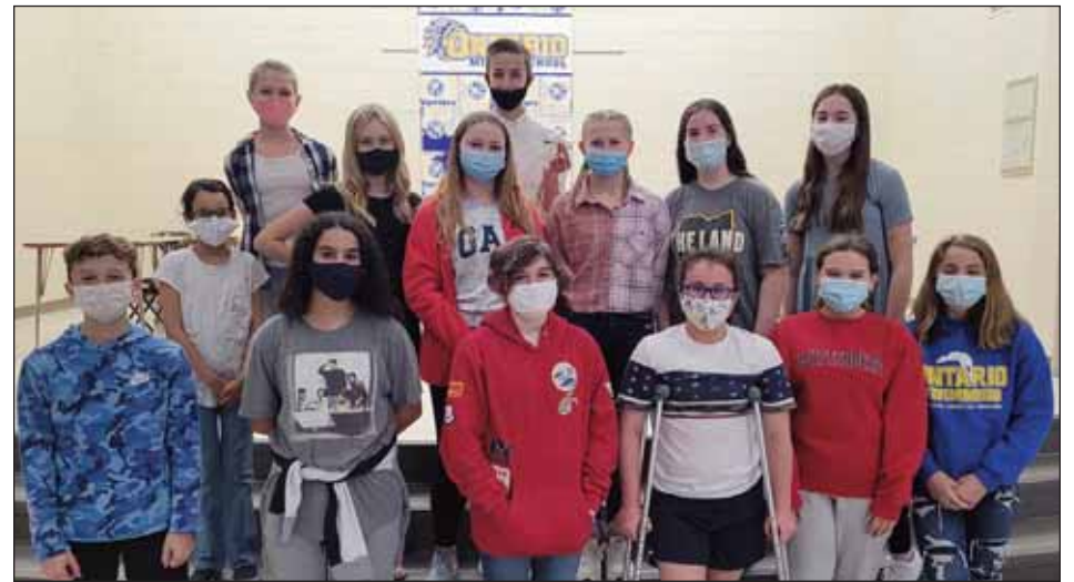
Ontario Middle School Seventh Grade All A's