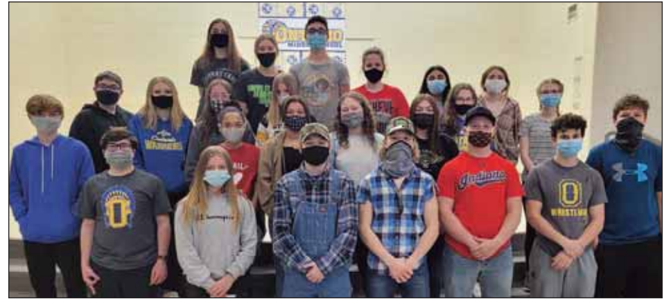
Ontario Middle School Eighth Grade All A's

Students at Ontario Middle School earned a special treat. Students with All A's during the third quarter were treated to ice cream and prizes from the Ontario Academic Boosters. Free meal certificates were also given from McDonald's and Fazoli's.