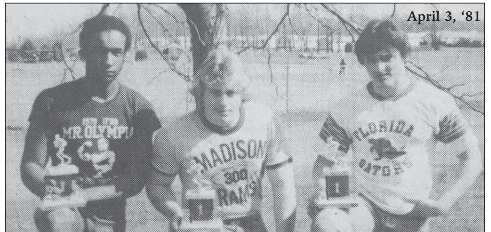
April 3, '81