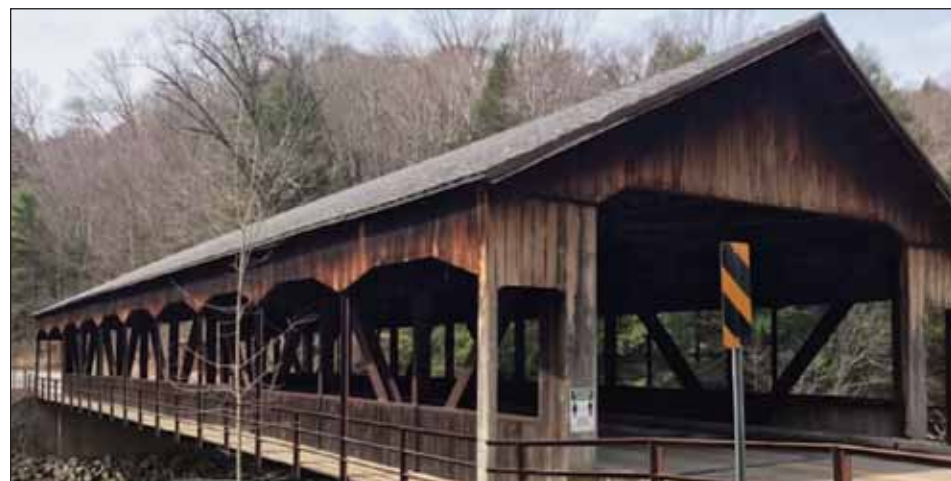
THE MOHICAN COVERED BRIDGE is a local spot many area residents visit throughout the year. It was built in 1969 and is located in Perrysville.

Hazing is a serious issue that we have the ability to combat, and we must work to stop more Ohio families from suffering the kind of pain the Foltz family is enduring.