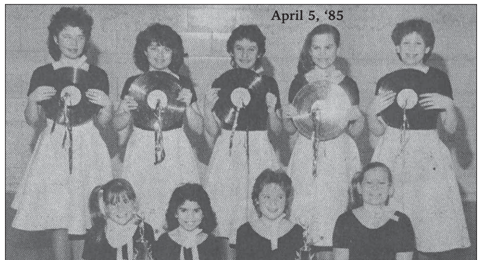
April 5, '85