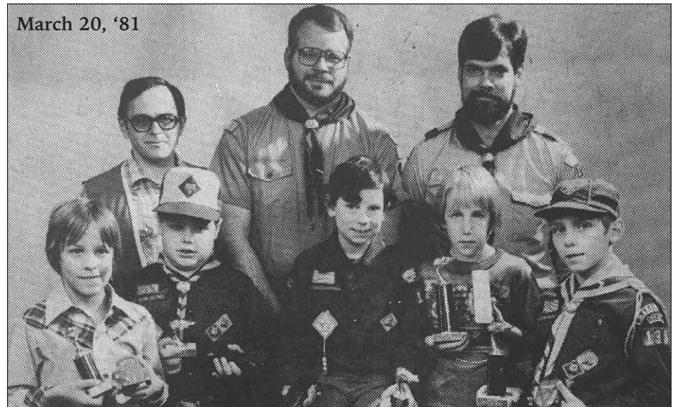
March 20, '81