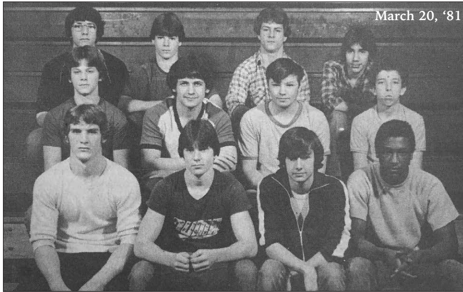
March 20, '81