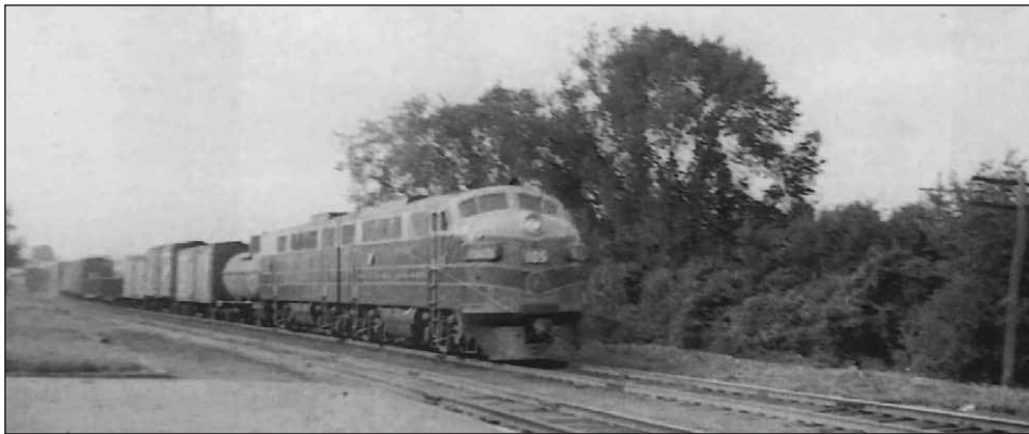
THE FIRST B&O DIESEL arrived in Lexington with little fanfare sometime around 1947-'48.