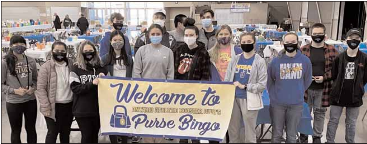
THE ONTARIO HIGH SCHOOL KEY CLUB volunteered to help set up for the annual Ontario Athletic Boosters Purse Bingo event.