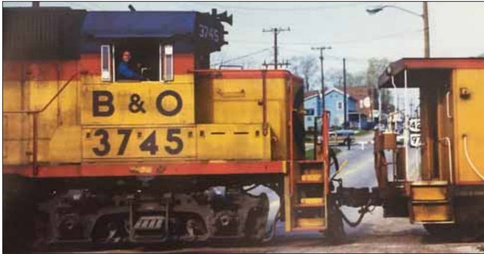
THE LAST TRAIN out of Lexington headed south dragging rails behind. Between the caboose and engine, the old Buck's Restaurant can be seen.