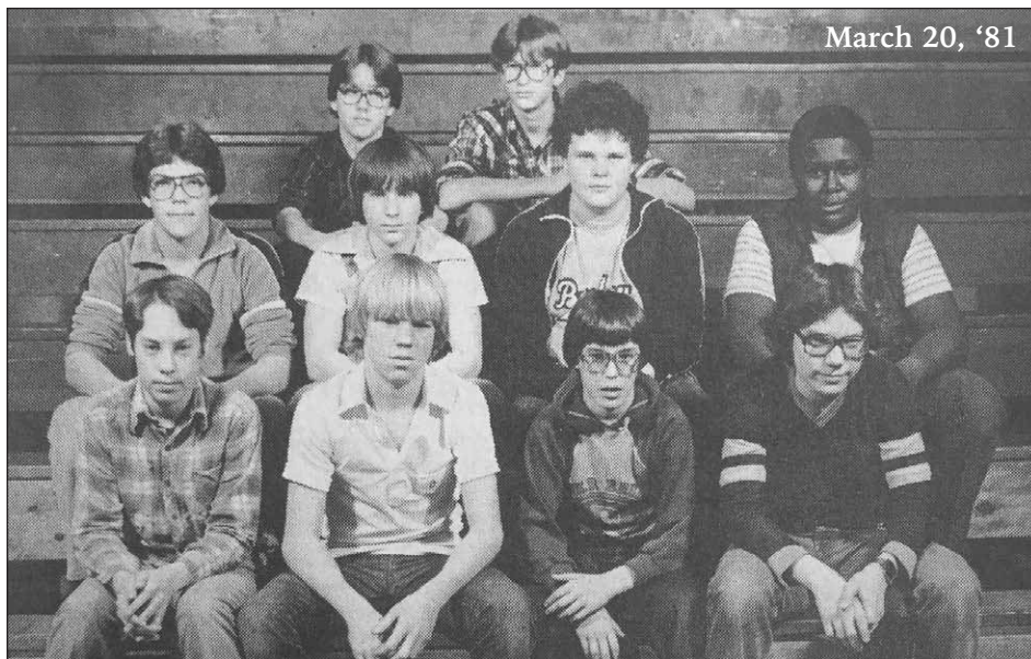
March 20, '81