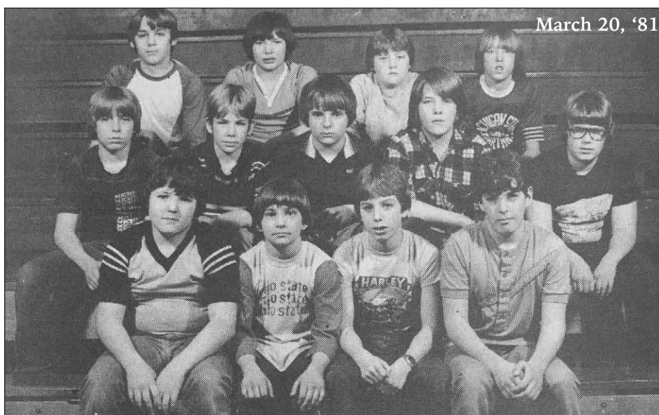
March 20, '81