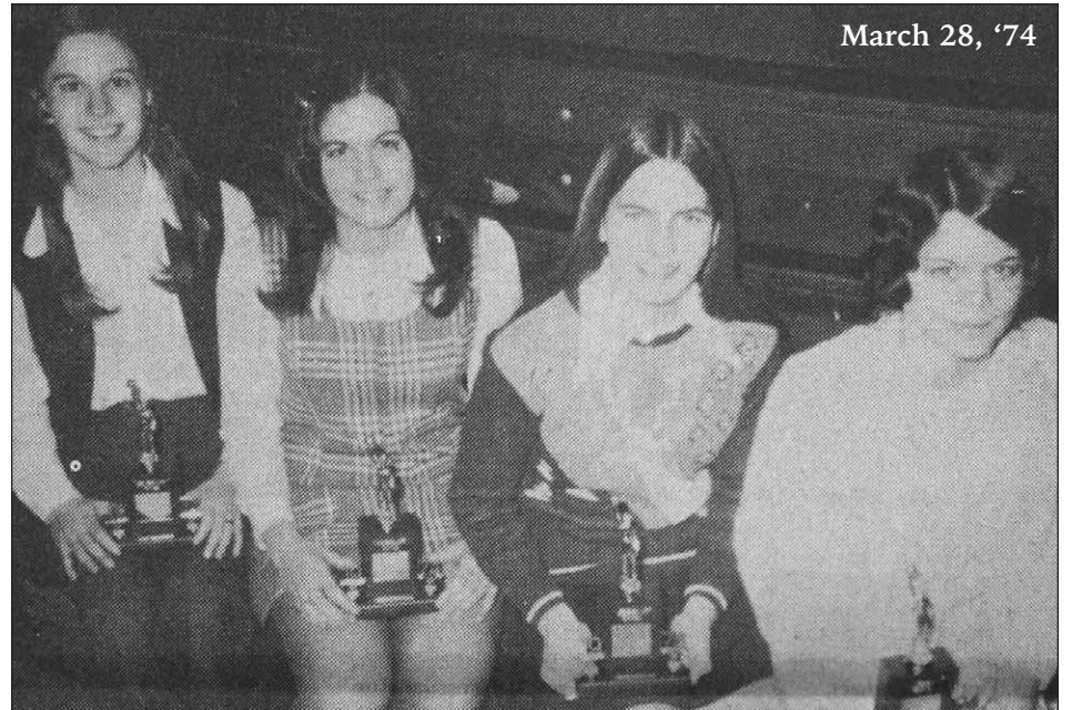
March 28, '74