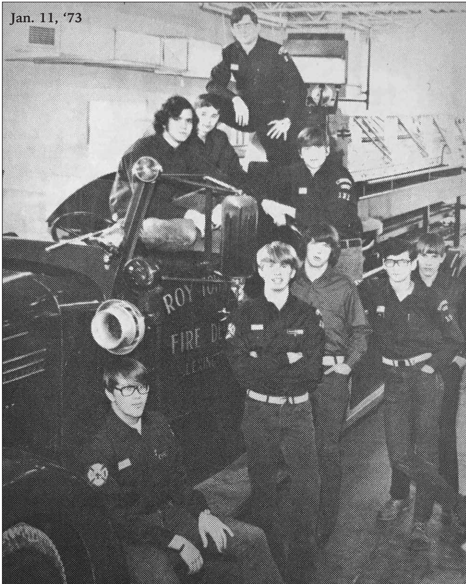
JAN. 11, '73 PROUD WORK — Boys of Troop 131 in Lexington proudly group around and on the 1942 Seagraves aerial truck which they helped to restore. They also worked on a 1942 Seagraves pumper. The lads have been making fire runs with the department but do not enter burning structures or risk their lives.