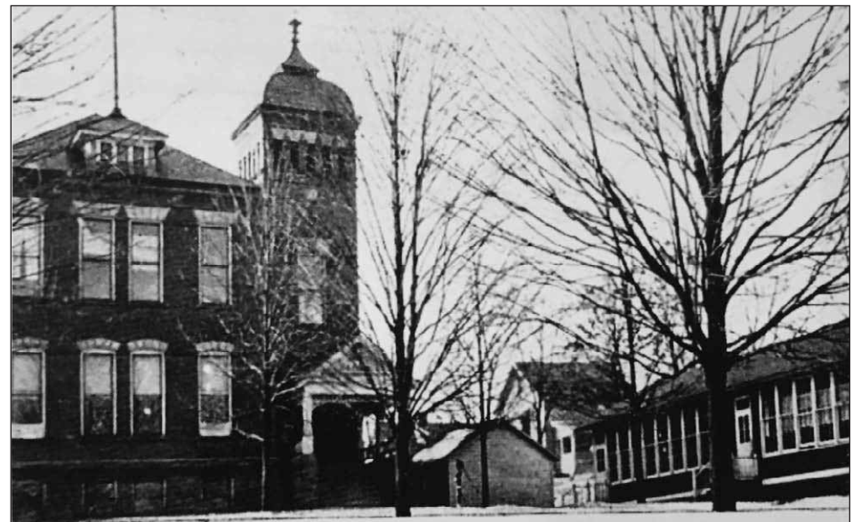
INCREASED ENROLLMENT forced the school board to build prefabricated classrooms next to the brick school. This photo was taken in 1927.