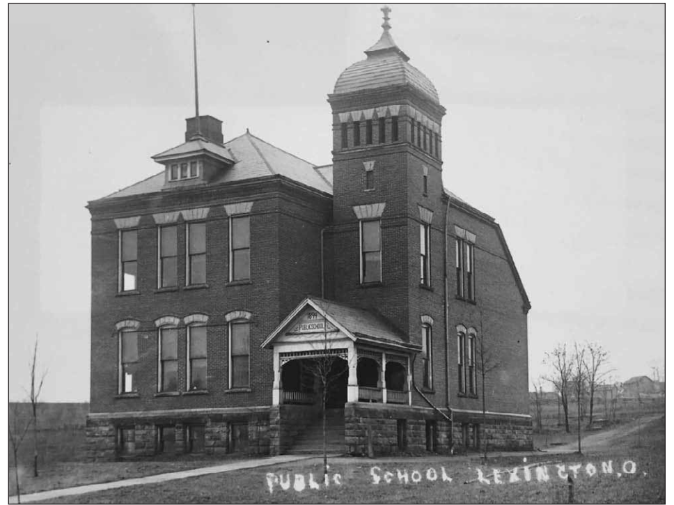
THE OLD 1894 LEXINGTON SCHOOL BUILDING is still in use after 126 years. It is hidden behind the current junior high which was constructed in 1930.