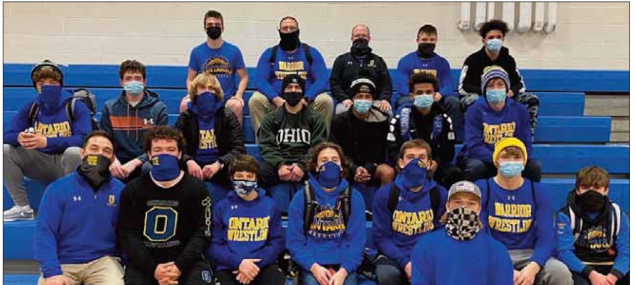
THE ONTARIO WARRIOR HIGH SCHOOL WRESTLING TEAM won the Mapleton New Year Invitational on Saturday, Jan. 9.