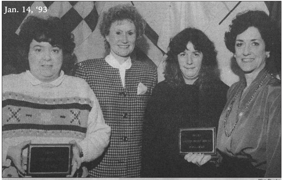
Jan. 14, '93