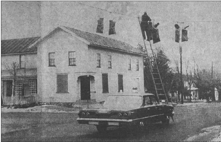
JAN. 10, 1963 — Westgate Electric employees install one of the six lights at the intersection of U.S. 30 and Shelby-Ontario Rd. The new Ontario police cruiser signals traffic to avoid the ladders.