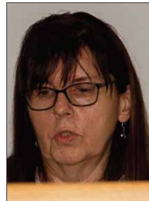
T-C Staff/Bud Motter

The zoning report showed four zoning permits issued for a total of $335. There were four sign permits for a total of $560 and one application variance/conditional for $190. The fire department made 214 calls for the month with 70 being non-EMS calls.