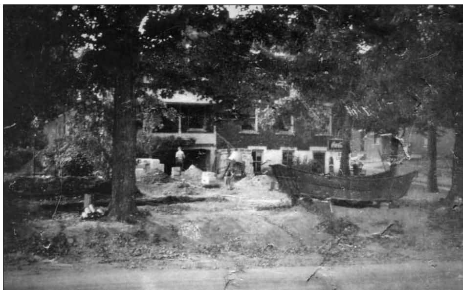
THE OLD MILLER CONESTOGA WAGON BOX laid between two maple trees on Mill St. in Lexington for many years.