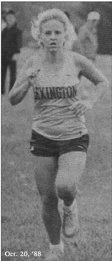
Oct. 20, '88