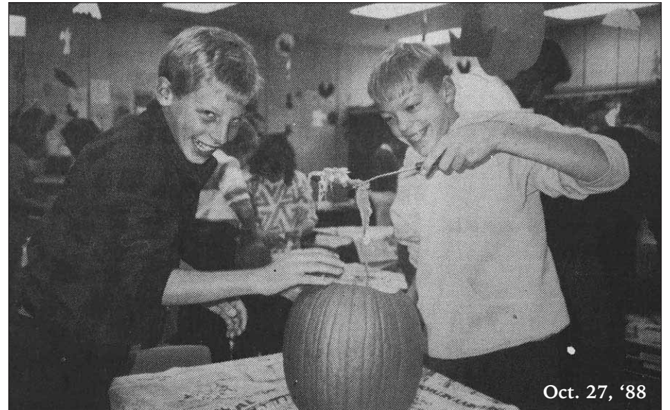
Oct. 27, '88