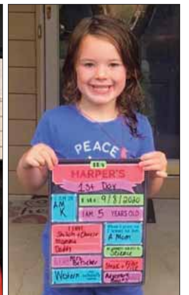
Harper Starkey Kindergarten Western Elementary