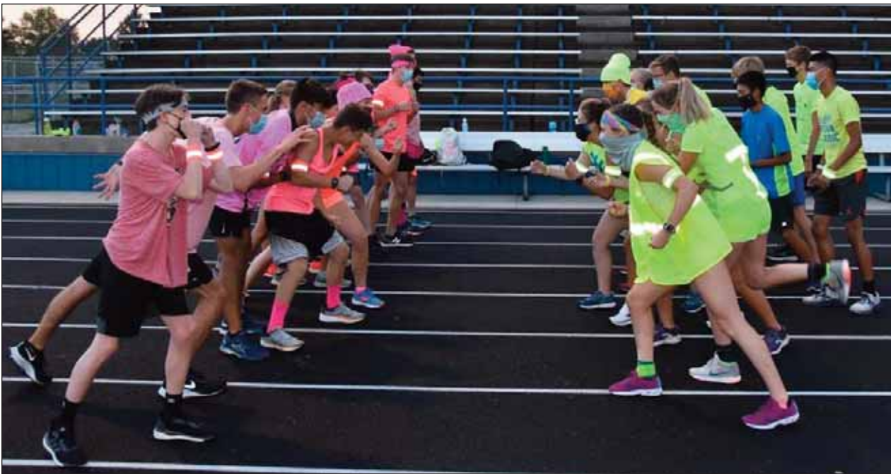
THE ONTARIO HIGH SCHOOL cross country team broke up into two teams to race one another in a 2-mile timed trial on Saturday, Aug. 15. The team had fun with some silly and competitive poses.