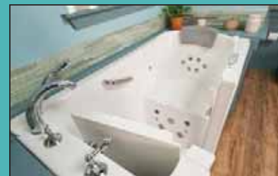
44 Hydrotherapy Jets