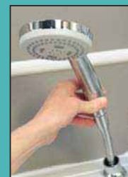
Hand Held Shower