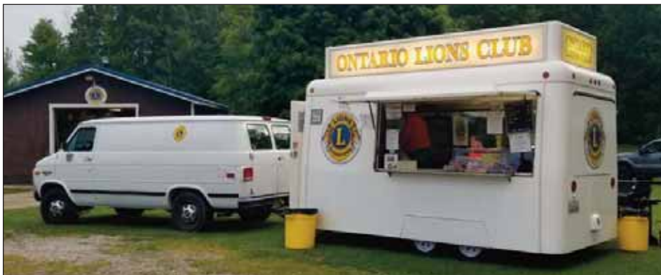
ONTARIO LIONS CLUB held its "BIG Yard & Craft Sale" Saturday, Aug. 15 at Ontario Lions Clever Park, Snodgrass Rd., Ontario. All money raised went to support Ontario Lions Club Community Projects.