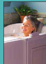
Comfort & Safety