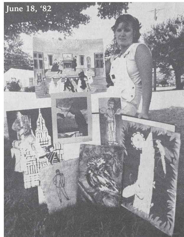
June 18, '82