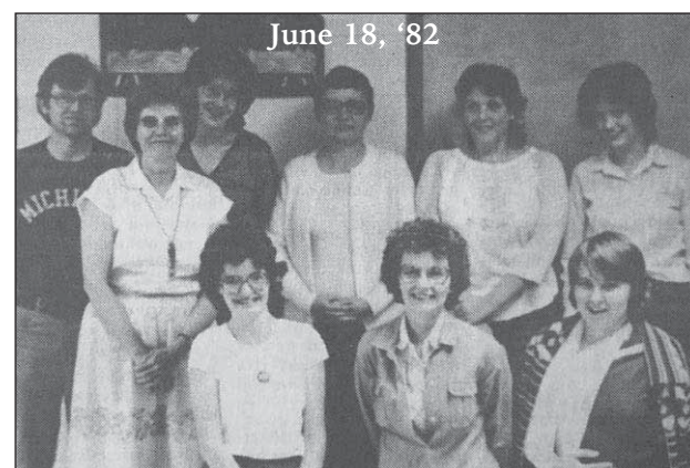
June 18, '82