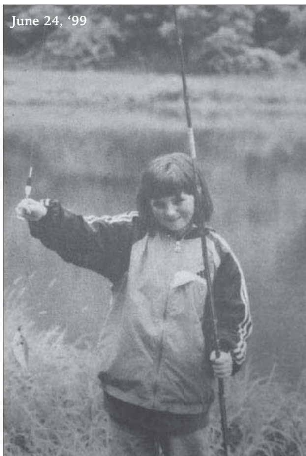
June 24, '99