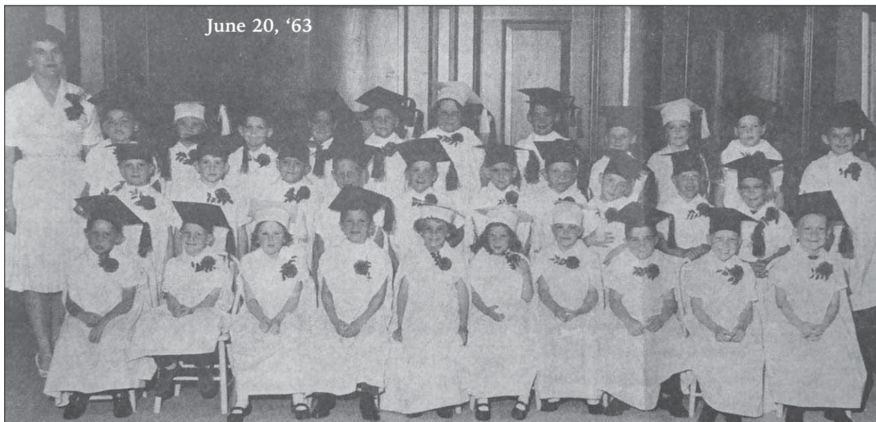
June 20, '63