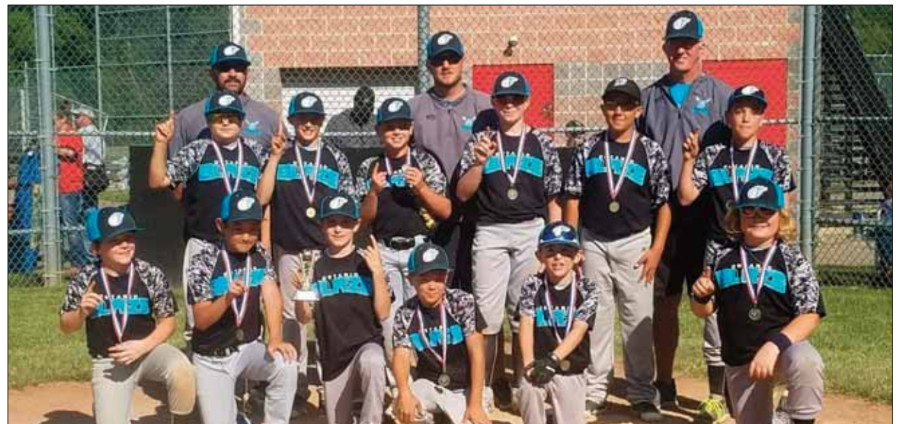
ONTARIO YOUTH SPORTS 10U Ontario Blaze were named Tommy Slugfest Tournament Champions at Aumiller Park in Bucyrus.