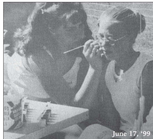
June 17, '99