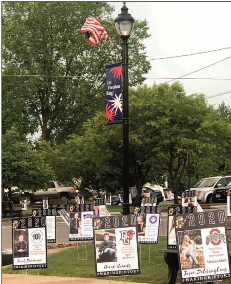
THE VILLAGE OF LEXINGTON showed support to its Class of 2020 high school seniors by placing signs around the square.

To learn more, visit ClevelandClinic.org/coronavirus and to schedule an appointment at Cleveland Clinic Cancer Center, Mansfield, call 419.756.2122.