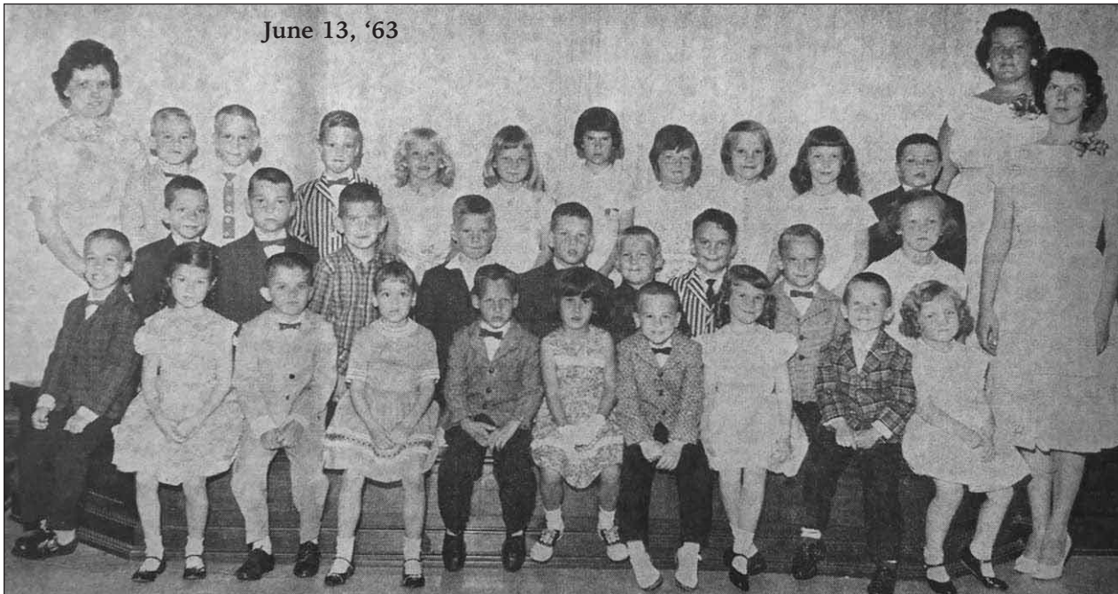
June 13, '63