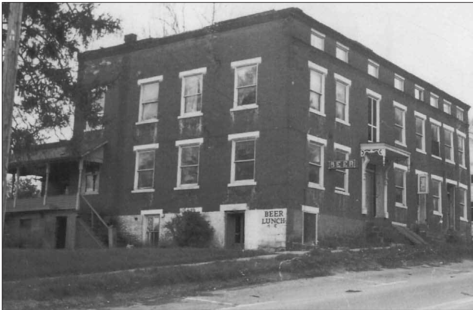
THE MINNEAR HOTEL was photographed in 1960 just before the building was demolished.