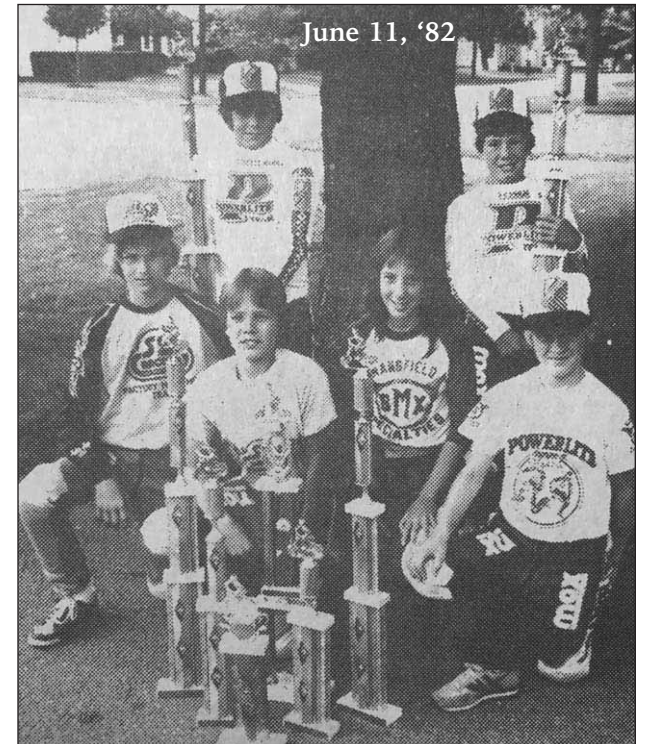
June 11, '82