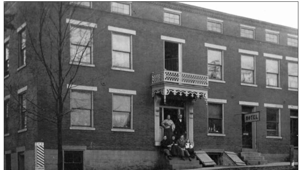
BELL AND BENNY MINNEAR stand in the doorway of the hotel with their four children.