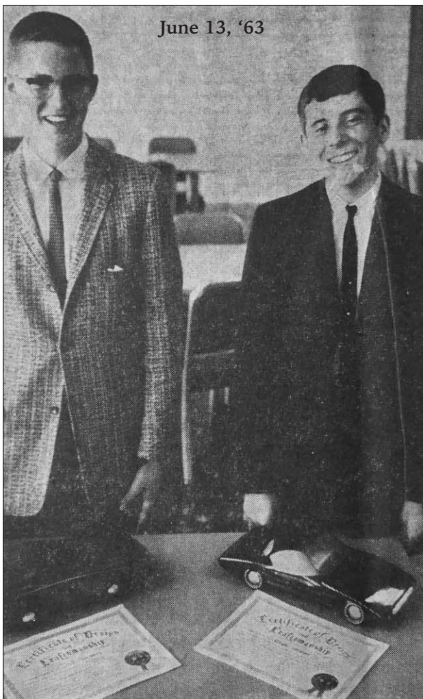
June 13, '63