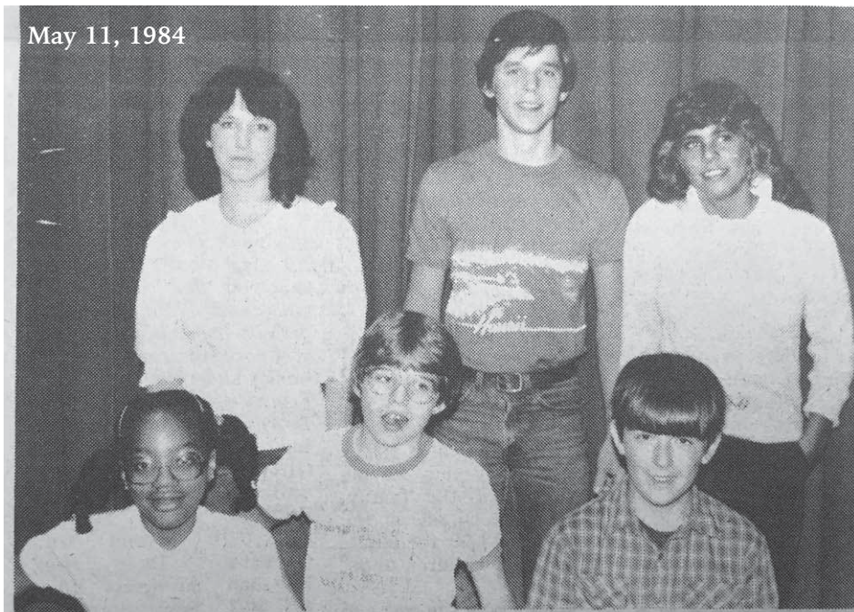
May 11, 1984