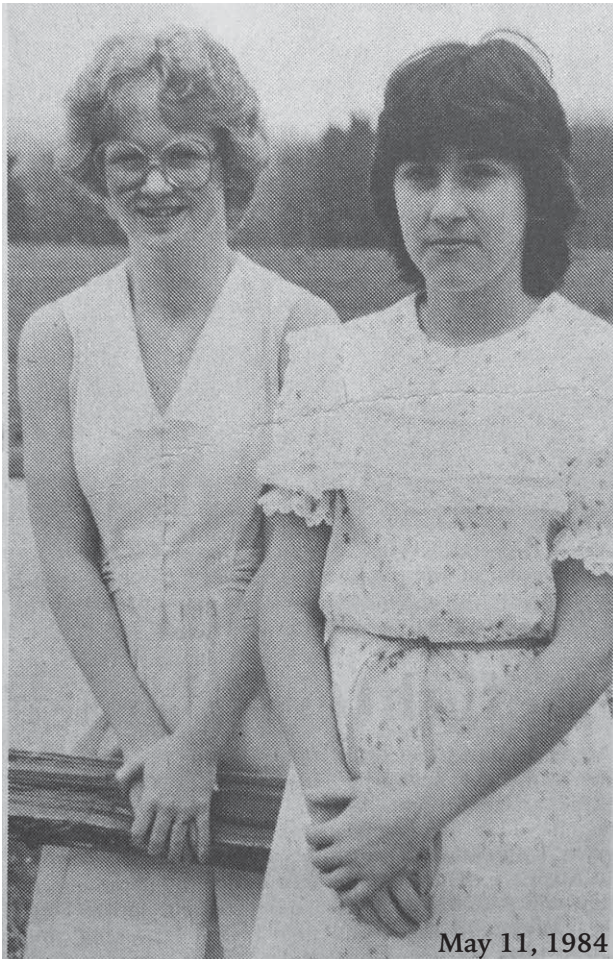
May 11, 1984