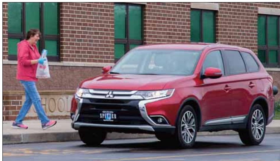
T-C Staff/Bud Motter