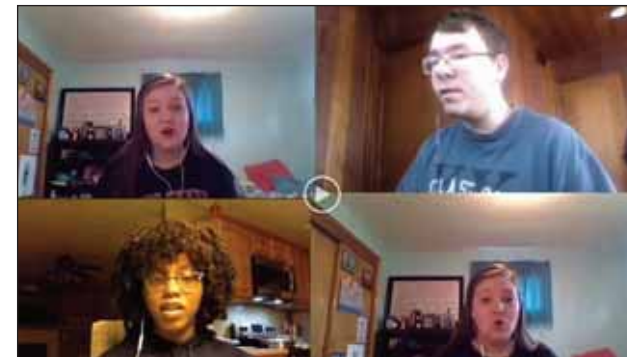
ONTARIO HIGH SCHOOL RHAPSODY IN BLUE members came together via the internet to sing "Love Runs Out." View it at www.ontarioschools.org/ontariohighschool_home.aspx .