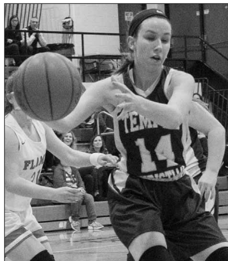
T-C Staff/Bud Motter

Rebounds - Lexington 35, Ashland 23. Turnovers - Lexington 11, Ashland 9.