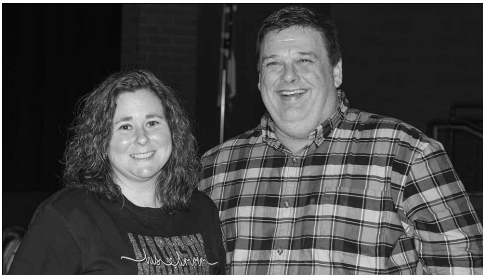
T-C Staff/Bud Motter

Look for The Entertainment Examiner's video posts on YouTube.