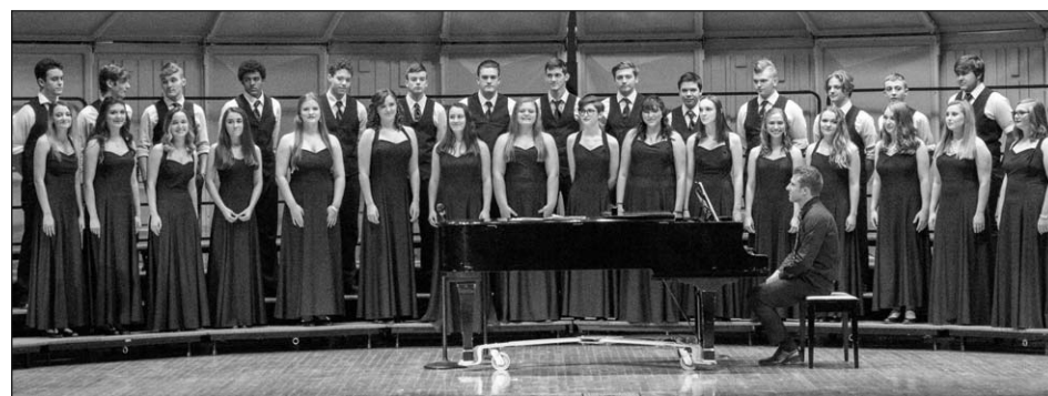
T-C Staff/Bud Motter

The Pioneer Board of Education consists of representatives named from Mid-Ohio Educational Service Center (6), Bucyrus