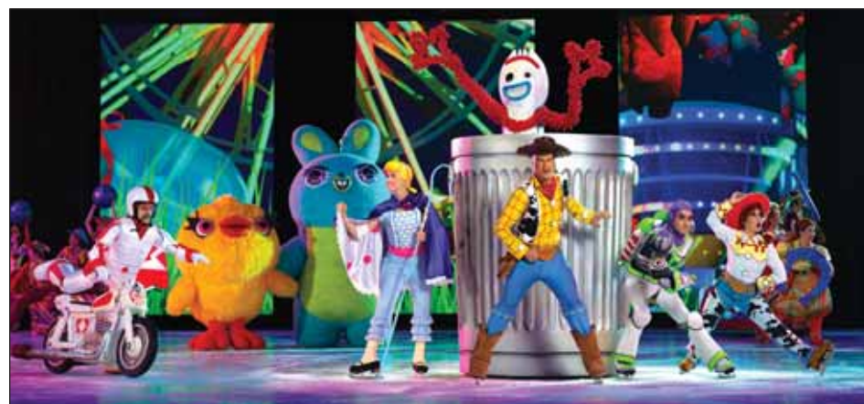
WOODY, BUZZ AND THEIR FRIENDS from Disney•Pixar's Toy Story 4 are among the many beloved characters visiting Cleveland as Disney on Ice Presents Road Trip Adventures.